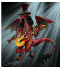
Dah'kyn, The Fiery Serpent of Sound Dragon/515 yrs/Male

The following are the NPC cards for the major NPCs for the Draconic Secrets server arc. These are currently the main players in the games and if there was anyone to be aware of then it would be these big lizards!